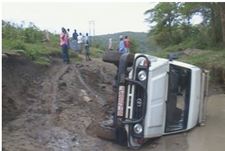
New State of the same Road in Karugutu Just after the Baraza week