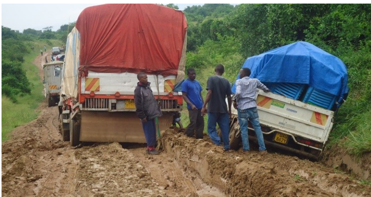
State of the Road in Karugutu before the Baraza preparation week

Most often during the week of Baraza preparations in a Sub county, or immediately after the Baraza is held local leaders prioritize the formerly stalled activities. Pictures below show what often happens in the Districts: