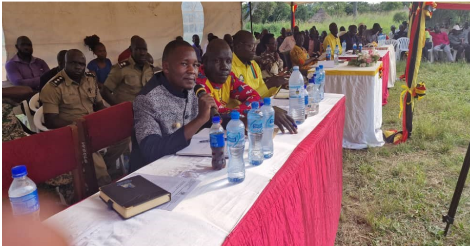
Picture: The RDC of Pakwach District chairs a recent Sub county Baraza in Wadelai Sub county, Pakwach District on 20 th July 2023