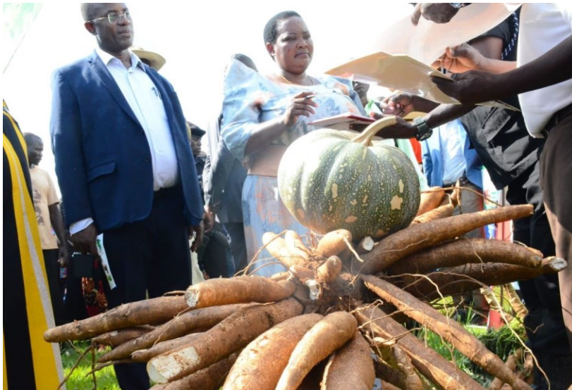
Picture: Uganda's Prime Minister Rt. Hon. Robina Nabbanja is chairing a regional Baraza in greater Mubende region. She also got joined by other Stakeholders to inspect / assess the reported outcome from Gov't Agricultural seedlings that were distributed to beneficiaries. 1 st September, 2023