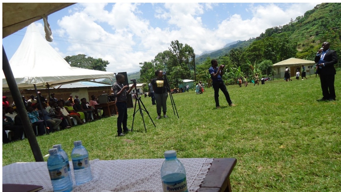
Media Crew at the Baraza in Harugali Sub county in Bundibugyo District, making the ordinary persons' voices be heard